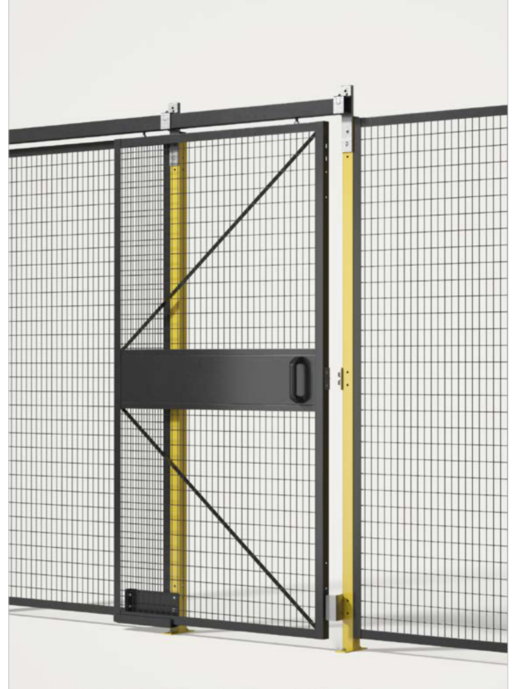
Slide door with snap lock

Our modular system consists of three system heights, multiple styles of doors and over 30 pre-fabricated wire mesh panel sizes. All pieces assemble and install precisely and easily. You'll enjoy worker safety, less downtime and compliance with federal safety regulations when you use Machine Guard Fencing to fulfill all of your machine guarding needs.