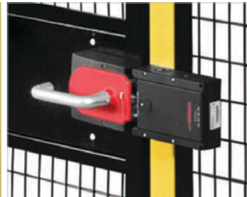
Safety Switch (Multiple Options Available)