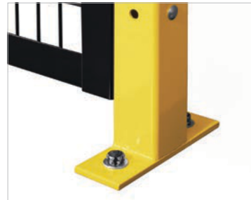
The sturdy 6" x 2" footplate makes the system extremely stable